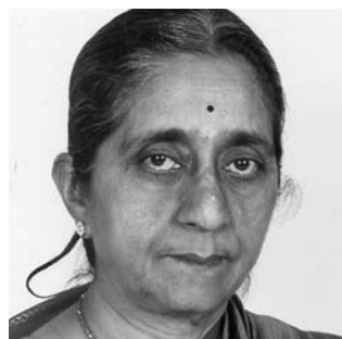
Smt. Kalanidhi Narayanan

Smt. Kalanidhi Narayanan , eminent dance personality, passed away on 21 February 2016. She was elected as Tagore Fellow of the Akademi.