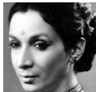
Smt. Mrinalini Vikram Sarabhai

Smt. Mrinalini Vikram Sarabhai , eminent dance personality, passed away on 21 February 2016. She was elected as Fellow of the Akademi on 1993.