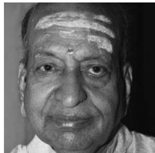
Shri N Ramani

Shri N Ramani , eminent music personality, passed away on 9 October 2015. He was elected as Tagore Fellow of the Akademi.