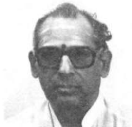
Shri Nedunuri Krishna Murthy

Smt. Sitara Devi , eminent dance personality passed away on 25 November 2014. She was elected as Fellow of the Akademi in 2008.