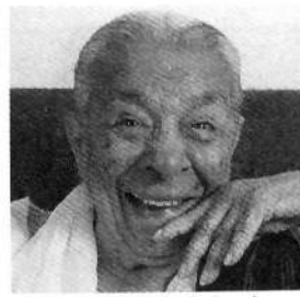
Smt. Zohra Sehgal