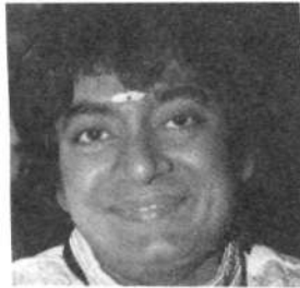
Shri U Srinivas