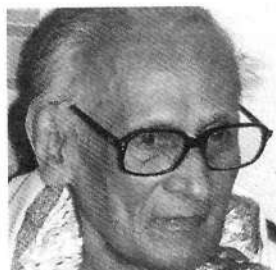
Shri Khaled Choudhury

Smt. Maya Rao , eminent Creative & Experimental dancer passed away on 1st September 2014. She was elected as Tagore Fellow of the Akademi in 2011.